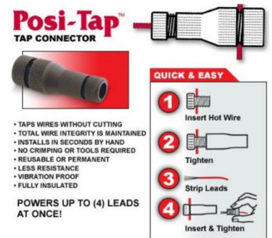
Posi-Tap above, used for connecting Power, Brake and Turn signal wires